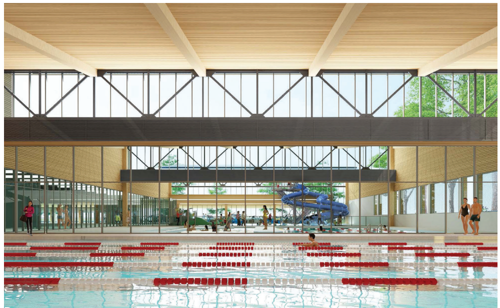
View of Lap Pool*