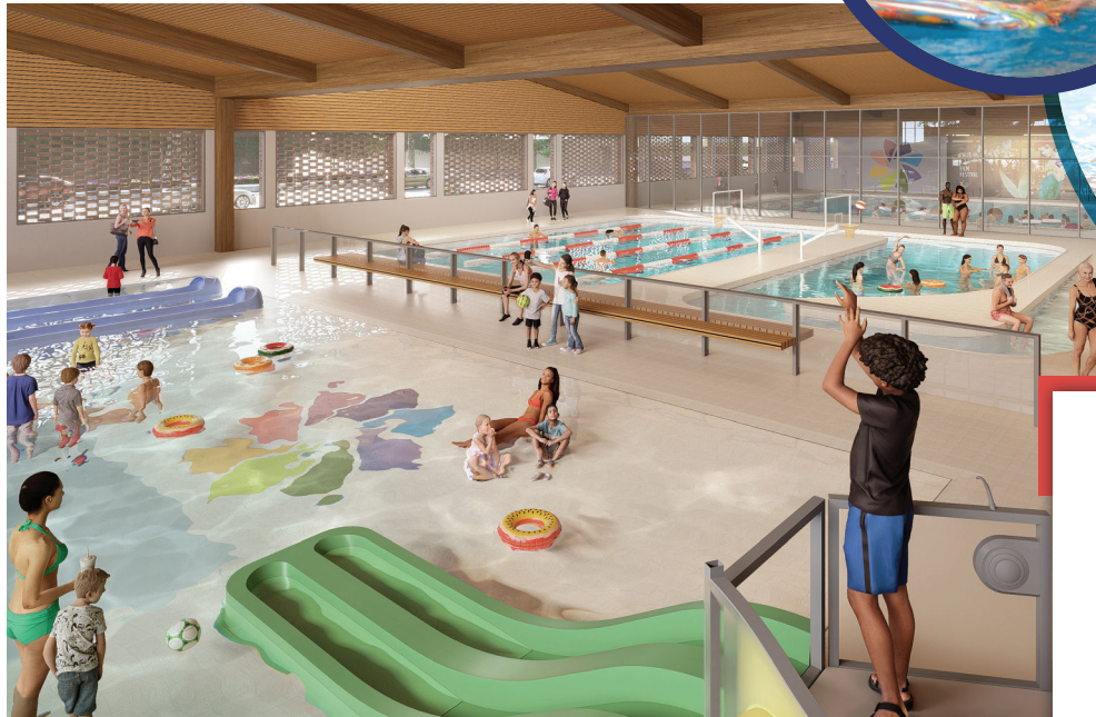
View of Splash Pad*

It is important to note the plan prioritizes accessibility for all ages and abilities, and the reuse of existing infrastructure where feasible. Residents will be included in the process as final designs are determined.