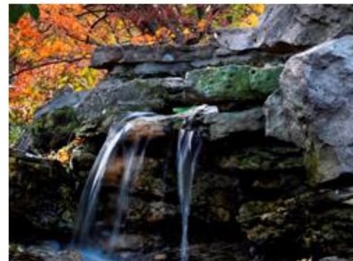
2009 - BEFORE