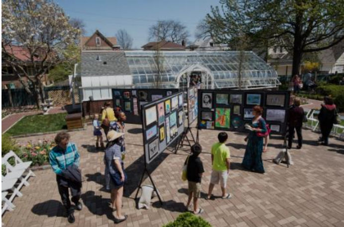
2020 - BEFORE