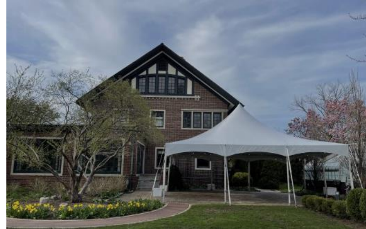
2023 - AFTER