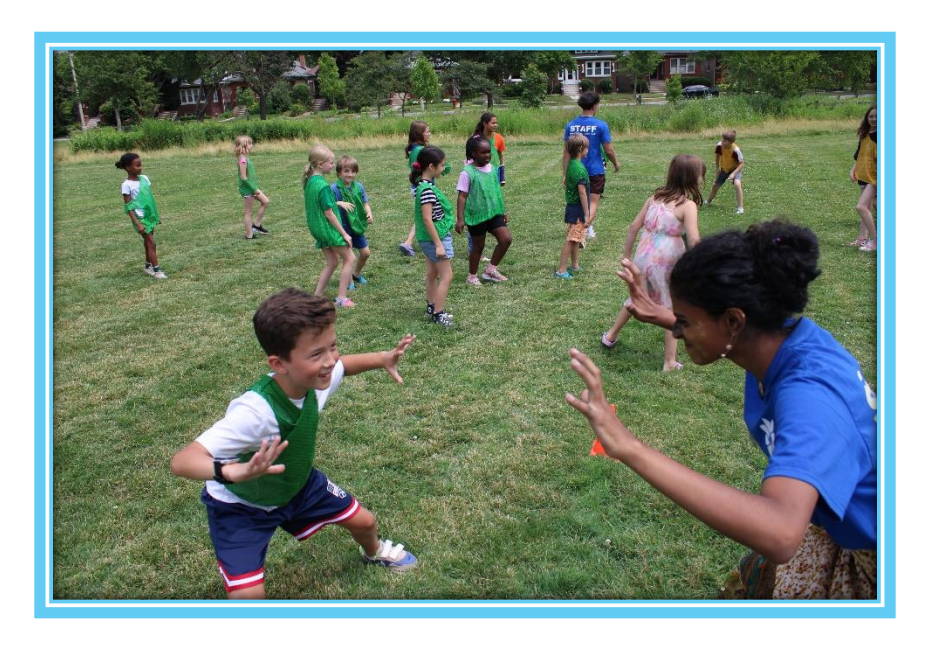
Park District of Oak Park | Parent Guide for Summer Camps 2025 | Page 11

To accommodate parents that have children enrolled in multiple PDOP camps throughout town, we offer flex pick-up from 3-3:30. <u>Please alert your child's site supervisor on the first day of each week if you are planning on utilizing the flex pickup option.</u>