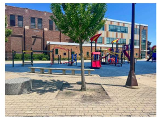
EXISTING 5-12 SCHOOL PLAYGROUND WITH RUBBER SURFACING