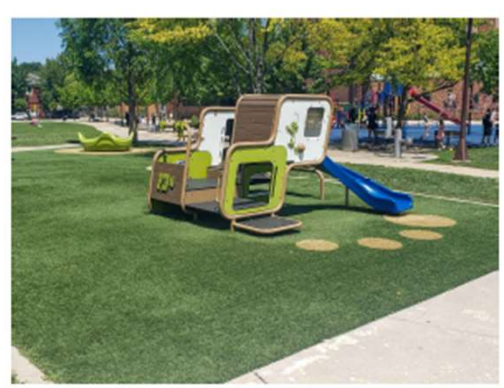
EXISTING TOT PLAYGROUND WITH SYNTHETIC TURF