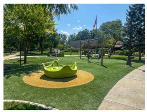
EXISTING TOT PLAYGROUND WITH SYNTHETIC TURF