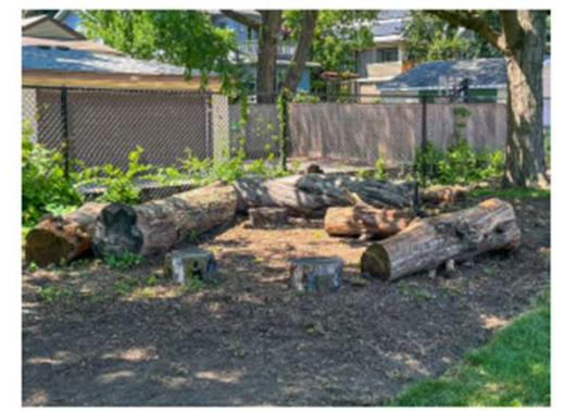
EXISTING NATURE PLAY