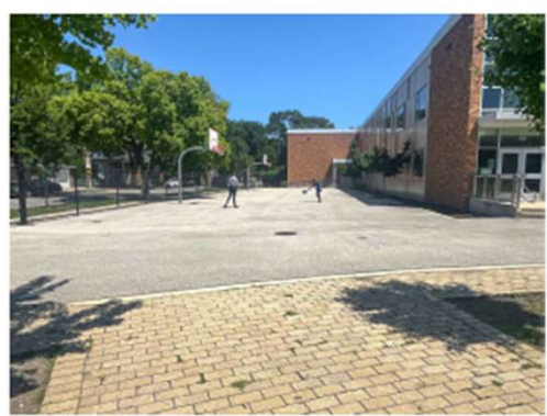
EXISTING BASKETBALL HOOPS