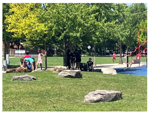
BOULDER OUTDOOR CLASSROOM