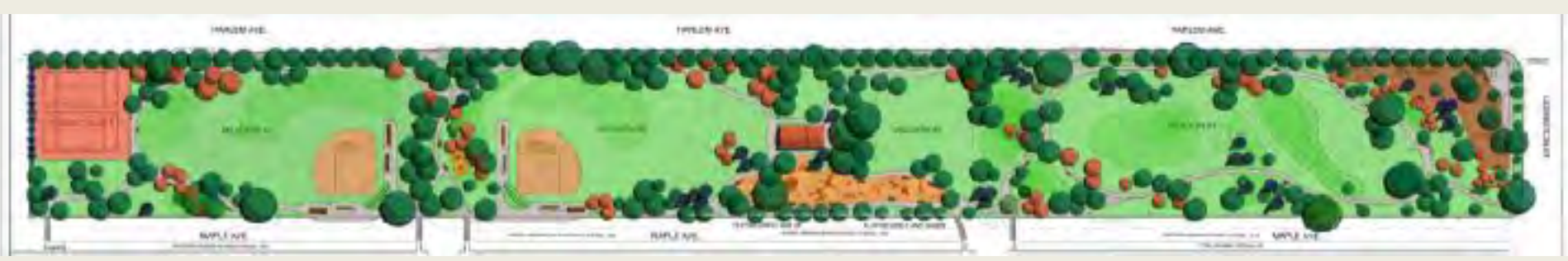
2007 - Plan