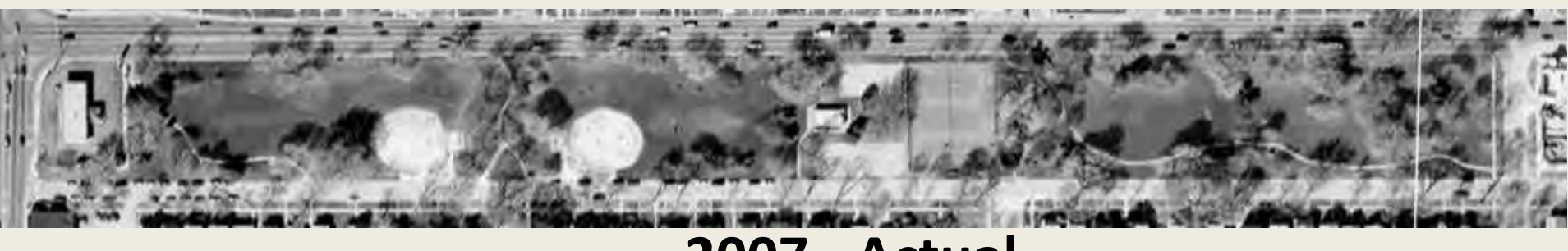
2007 - Actual