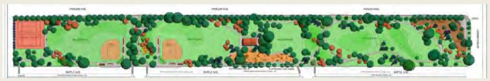
Created Plan in 2007