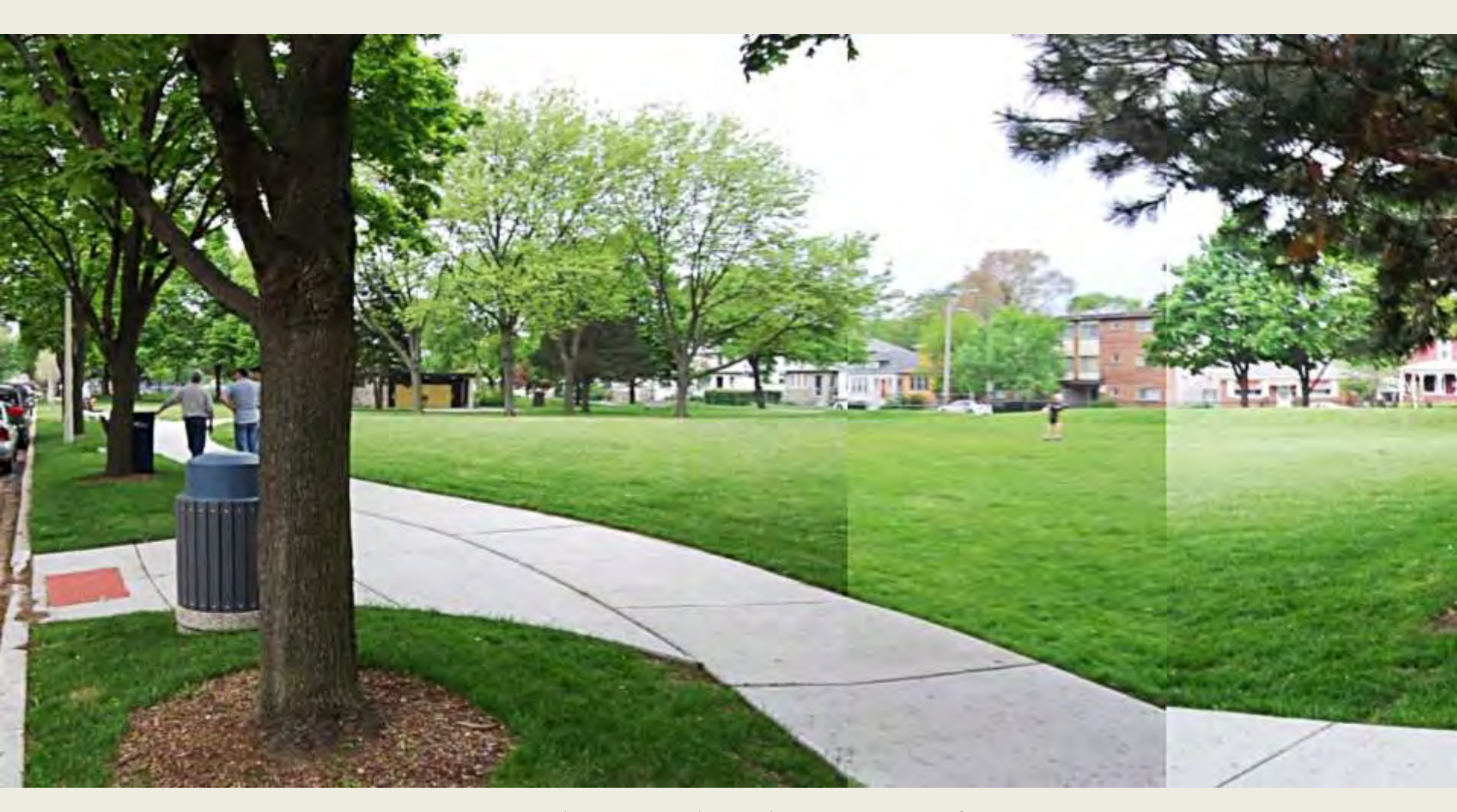
Open meadow with relocation of courts