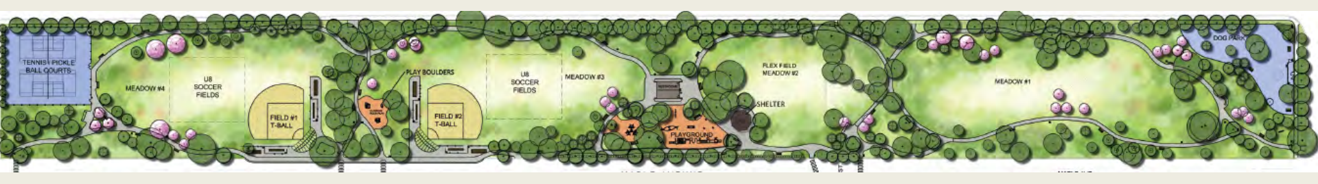
2013 - Design