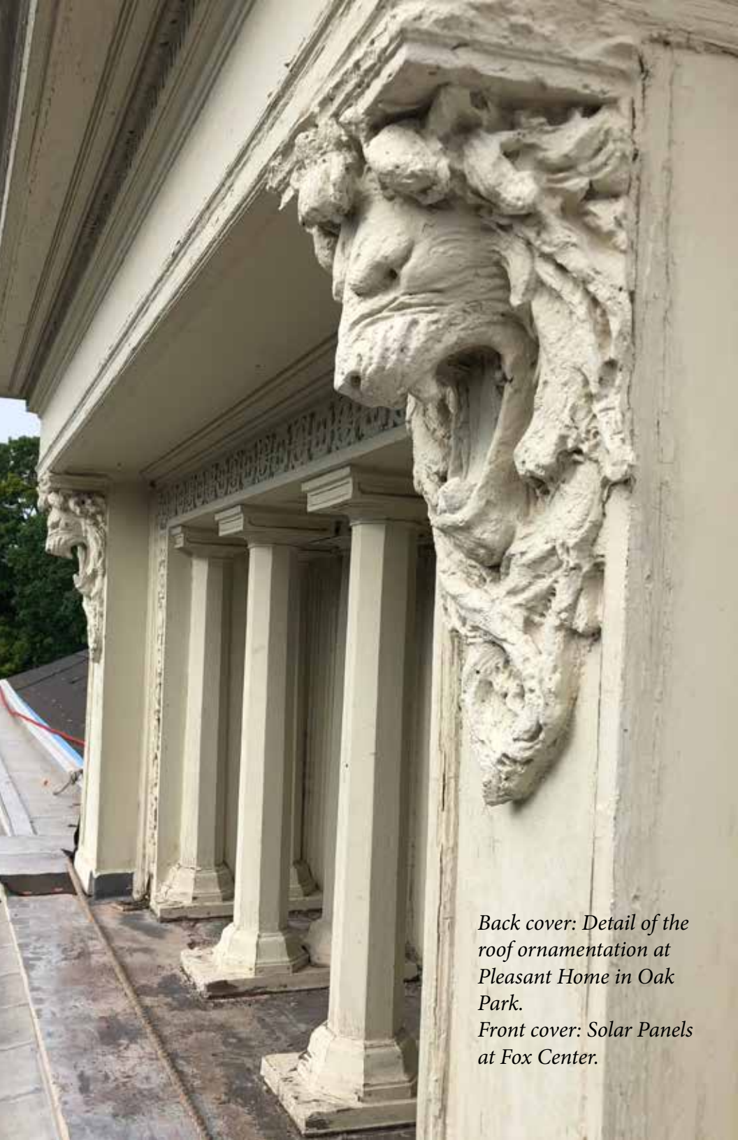
Back cover: Detail of the roof ornamentation at Pleasant Home in Oak Park.